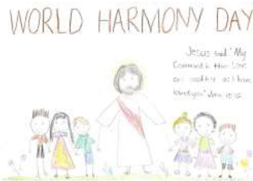
Serenity Mendoza K/1M