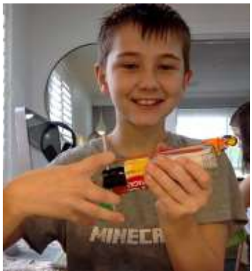
Rubber band gun!

5H completed some science experiments and posted some of their photos and videos to class.